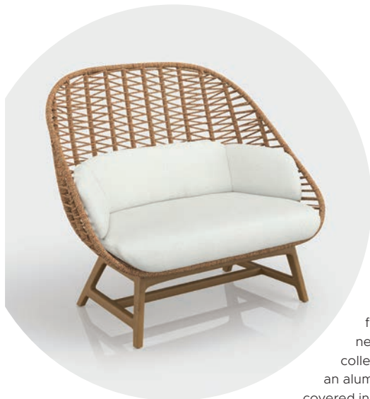
LEFT: This seashell-inspired chair from Tidelli's new Organika collection features an aluminum structure covered in nautical rope.