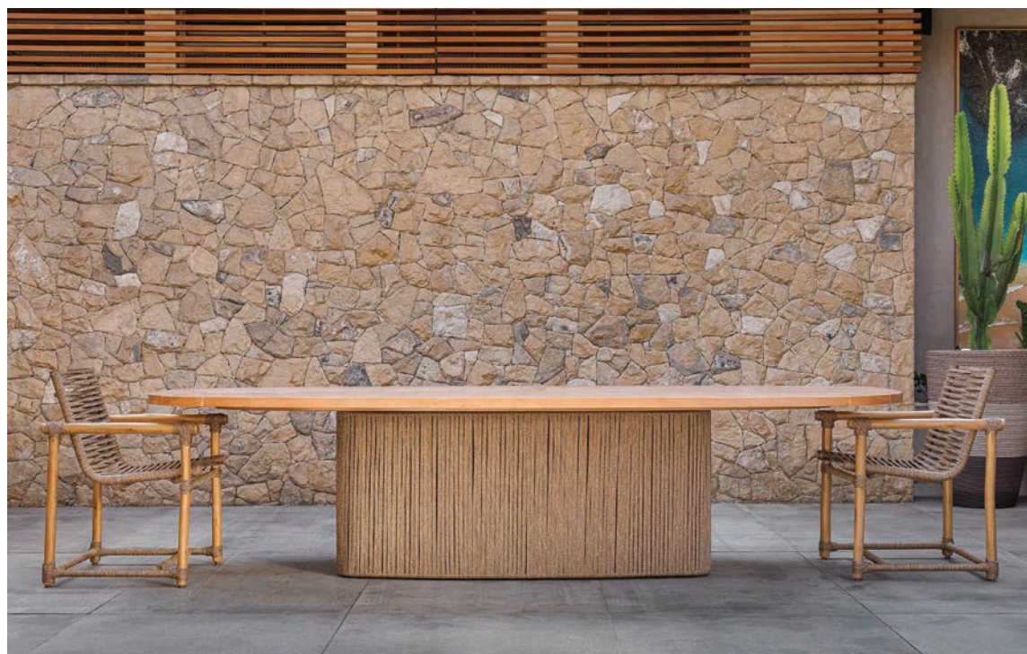
ABOVE: A dining table and chairs (made of wood and nautical rope) from Tidelli's new Organika collection