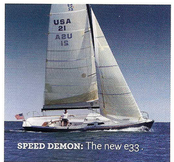
SPEED DEMON: The new e33.