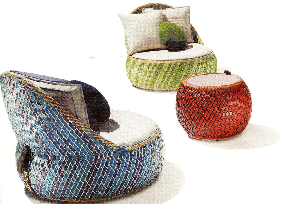
ABOVE: The Dala outdoor collection of circular chairs, cocktail tables and lounges from Dedon are casual, portable and intricately woven with brightly colored, plastic ribbons. www.dedon.us

Furnishing with color has never been more fearless. From fashion runways to designer showrooms, color is a powerful tool that conveys profound emotions and sets the mood of a room. Stylish sofas, lounges, dining suites, accent pieces and elegant patio groupings dressed in rich, striking color convey an appeal that is timeless. Designers wrap vintage furnishings in retro hues of green, orange and aqua blue mixed with shades of brown; and palettes of sultry purple add glamour with a demure touch of pink accents. Clean and crisp, stripes and textured fabrics in cooler tones showcase pale blue and steely gray. Earth tones spread warmth with deep brown and adobe orange, while jewel tones in emerald green and ruby red lend a dash of sparkle and pizzazz to the mix. M